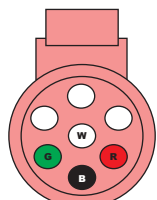
HALTECH IQ3 CONNECTOR LOOKING INTO CONNECTOR