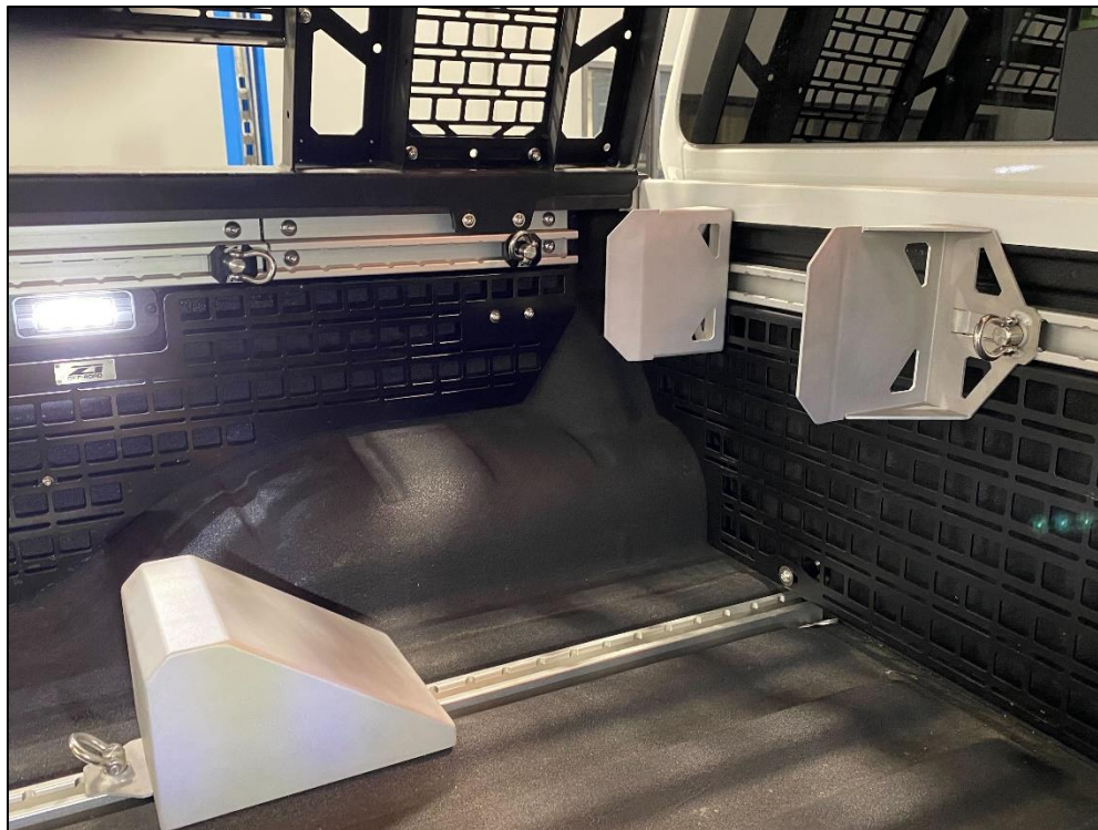
Installed Utility Track Spare Tire Mount